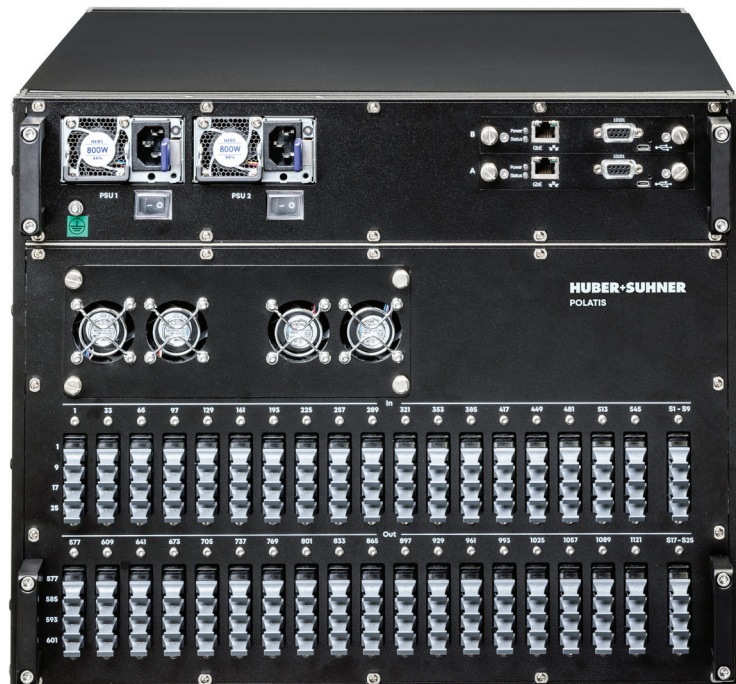
POLATIS 576x576 Optical Circuit Switch with MTP Connectors